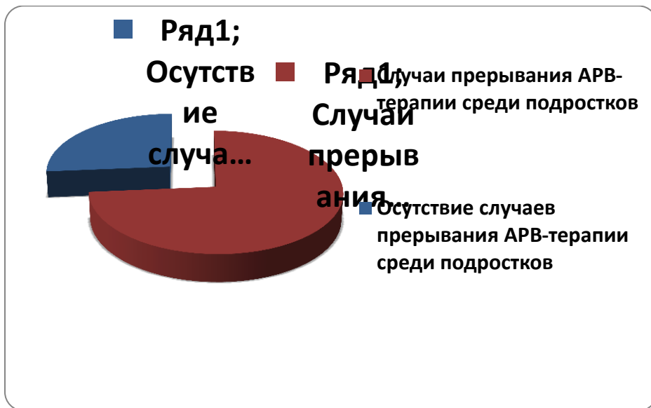
Fig. 1. Cases of ARV treatment interruption among adolescents in the regions

■ Cases of ARV treatment interruption among adolescents