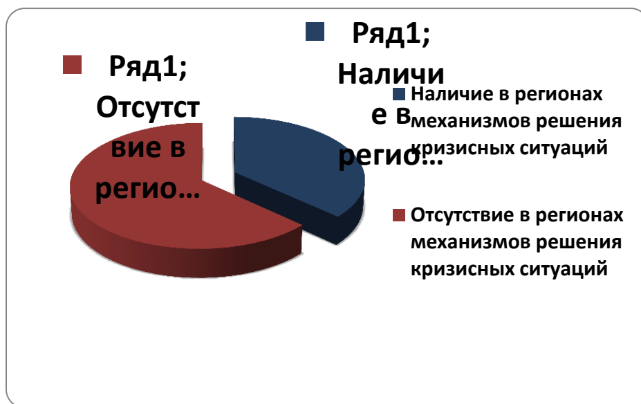
Fig. 2. Availability of mechanisms to address crisis situations related to adolescent ARV treatment interruption in the regions

Unfortunately, not all regions have similar mechanisms to resolve crisis situations. Only 7 of 19 regions (Poltava, Cherkassy, Chernihiv, Kiev, Vinnitsia and other oblasts) had at least some mechanisms to address crisis situations related to adolescent treatment interruption.